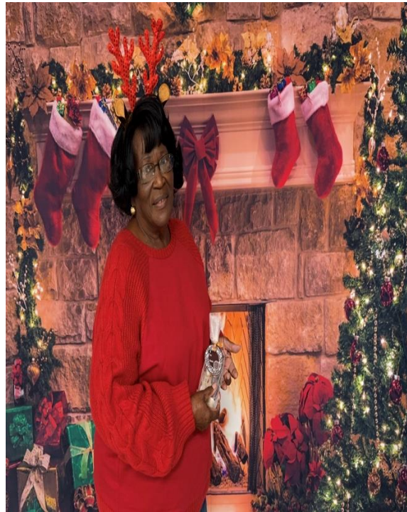
Seniors Enjoying Gifts