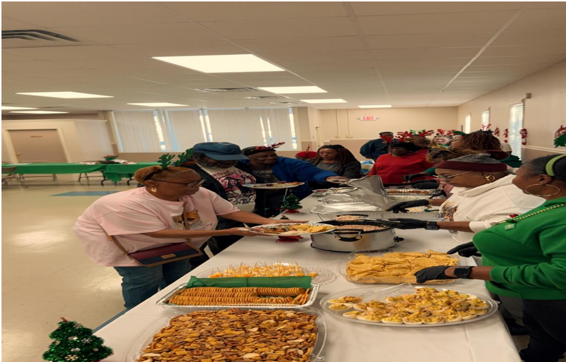
DHA Staff serving the Seniors