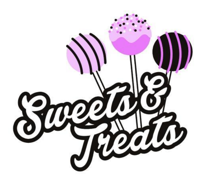
Enjoy your sweets and your treats!