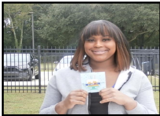
DHA Wellness Care Winner-Almarie Eady-Picture not shown